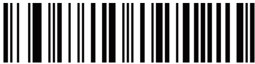
Enable Data Matrix