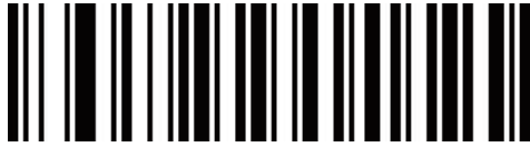
Enable EAN13 to ISSN